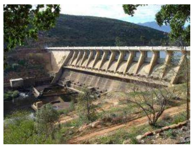
Figure 1: View of existing Clanwilliam Dam Wall from western bank

The Clanwilliam Dam is an existing impoundment structure (see Figure 1) and was constructed in 1935 prior to the coming into effect of the National Environmental Management Act (107 of 1998) (NEMA), the NWA as well as Specific Environmental Management Acts such as the National Environmental Management: Waste Act (59 of 2008) (NEMWA). Structural changes made to the Clanwilliam Dam to date include raising the dam wall with the addition of 13 crest gates and through the use of pre-stressed cables. The Clanwilliam Dam wall is 43 meters high and the dam has a storage capacity of 124 million m<sup>3</sup> which will be increased to 362 million m<sup>3</sup> with the proposed raising of the dam